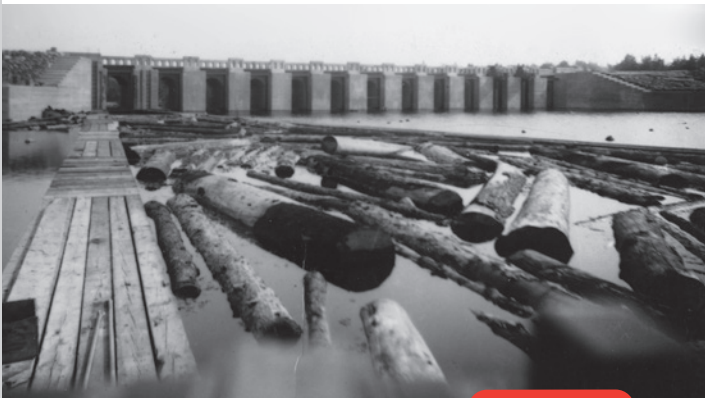
Nation's first reservoir system: Pine River Dam, Crosslake, Minn., 1906.

The earliest description of the St. Paul District's boundaries included the Mississippi River drainage from the river's headwaters to the lower end of Lock and Dam 1 between St. Paul and Minneapolis, together with the Red River of the North drainage as far as the international boundary with Canada, and the Rainy River drainage in northern Minnesota, which encompasses the boundary waters area. The district was extended south in 1919 to the mouth of the Wisconsin River and again in 1940 to Lock and Dam 10 at Guttenberg, Iowa. A portion of the Upper Peninsula of Michigan draining into Lake Superior and Isle Royale were added to the district in 1941 but lost in another realignment in 1979.