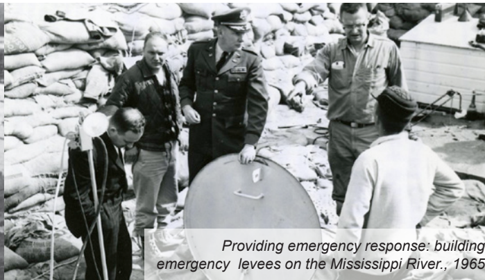
Providing emergency response: building emergency levees on the Mississippi River., 1965