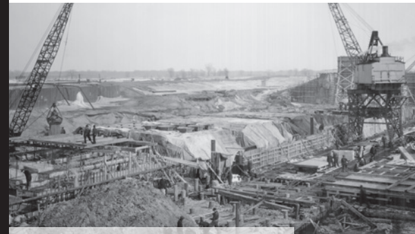
Building the locks and dams: Lock and Dam 7, La Crescent, Minn., 1936.

The history of the St. Paul District is the history of the upper Midwest and its growth over more than a century. When the district was established in 1866, there was a crucial need to prevent the disintegration of the Falls of St. Anthony, and, with it, the commercial importance of the Minneapolis milling center. After solving that engineering problem, the district saw and influenced the growth and demise of the lumber industry, the rise of the flour industry, the development and operation of Yellowstone National Park, the change from steamboats to diesel powered towboats on the Mississippi, the first flood control and hydroelectric power projects in the nation and, in most recent years, the creation of a very popular outdoor recreation program. No stranger to controversy, the district, has, nevertheless, strived to respond to the needs of this important region.